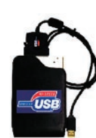
USB Laptop IF Kit P/N HTS-6595-USBKIT