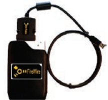
IEEE1394B (Firewire) Laptop IF Kit P/N HTS-6595-FWKIT