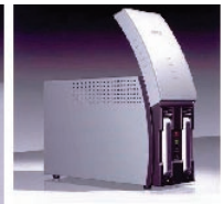
RAID-1 Mediapac™ copier metallic color P/N HTS-2RAID-0SR