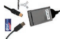
PCMCIA Laptop IF Kit P/N HTS-6595-PCMKIT

External Mediapac Bay Part Numbers: ▶ HTS-6500-BAY-USFW-EXT: HardTape Bay Kit External with USB/FW Interface. ▶ HTS-6500-BAY-SC50-EXT: HardTape Bay Kit External with Narrow 50-pin SCSI Interface ▶ HTS-6500-BAY-SC68-EXT: HardTape Bay Kit External with Wide 68-pin SCSI Interface.